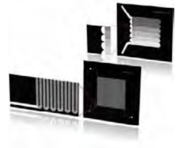
Bespoke chips for MMP, Flowback, Flow Assurance and more.

With fewer chemicals and less time required compared to conventional methods, we not only provide an alternative solution but also ensure minimal environmental impact.